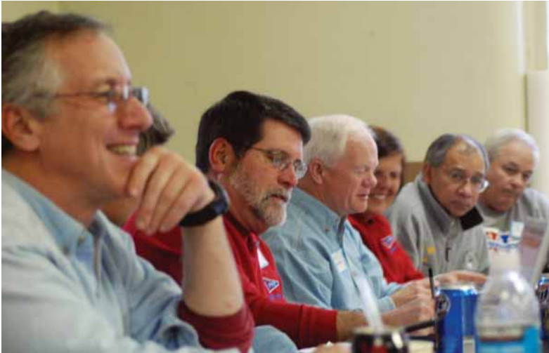
Despite February's chill, club members packed the Lecompton Community Center for the 2008 winter membership meeting. Top right: new members introduced themselves.